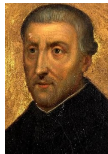
St. Peter Canisius

Saturday 21 Readings: Sirach 48:1-4, 9-11. Mt 17:10-13. R: Lord, make us turn to you, let us see your face and we shall be saved. St Canisius, priest, doctor.